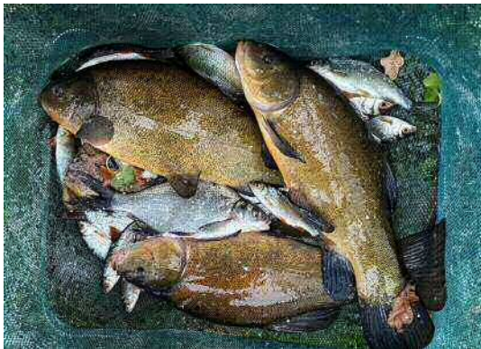
Andy Bennetts winning weight included 3 lovely Tench